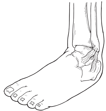
Injured ankle with laxity of ligaments

surgeon will ask you about any previous ankle injuries and instability. Then he or she will examine your ankle to check for tender areas, signs of swelling, and instability of your ankle as shown in the illustration. X-rays, CT scans, or MRIs may be helpful in further evaluating the ankle.